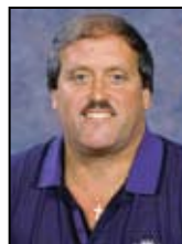
Del Enos Statistical Crew